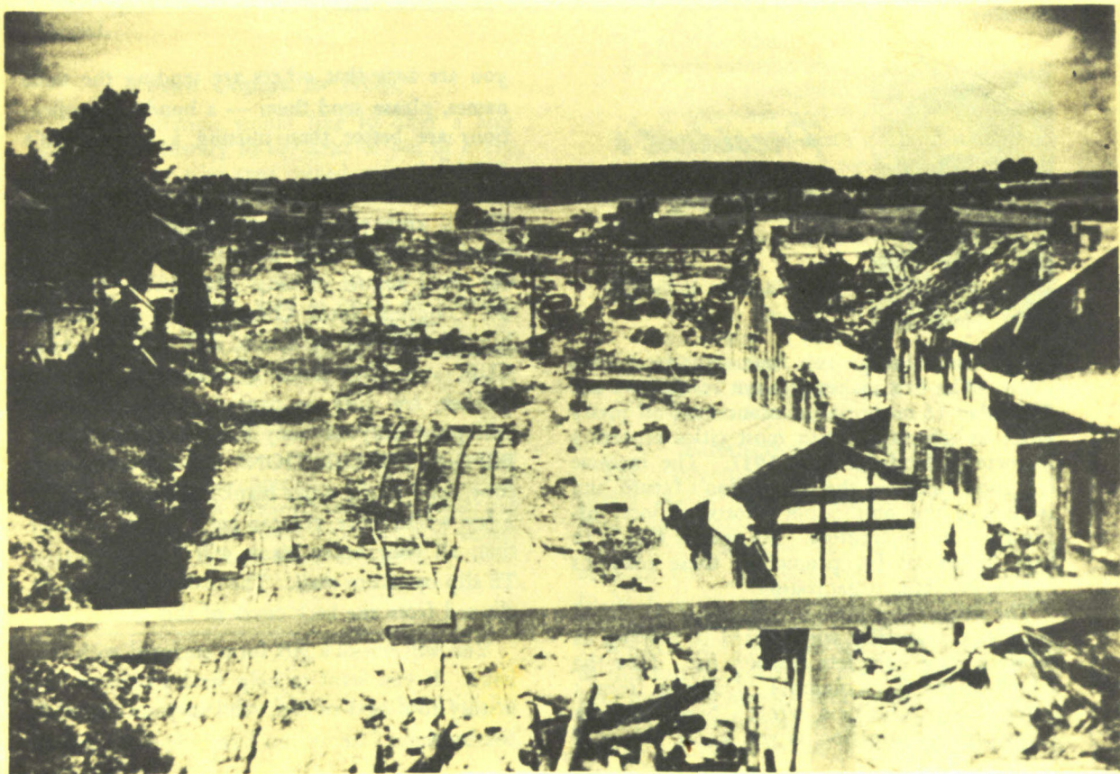
RAILROAD YARDS AT ST. VITH