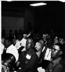
Business Meeting Atlanta, 1975